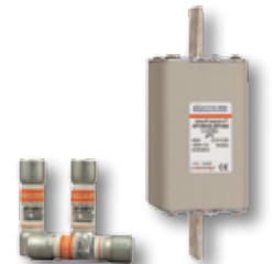
HP10M PHOTOVOLTAIC (PV) FUSE SERIES AND HP15NH3L PV FUSE SERIES