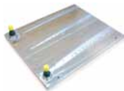
LIQUID COOLED AQUAMAX® VACUUM BRAZED ALUMINUM HEATSINK

All Mersen laminated bus bars models are optimally designed to minimize unwanted "skin effect" resulting from high switching nature of Silicon Carbide (SiC) applications. Mersen's dedicated teams of application engineers work closely with our customers from the very early design stages to create the optimum cooling and bus bars solutions to effectively reduce system weight and increase efficiency. Mersen's photovoltaic (PV) fuse series was engineered and designed specifically for the protection of photovoltaic systems. Its enhanced fuse construction makes it ideal for continuous temperature and current cycling withstand adding to system longevity. Here are some examples of our solutions: