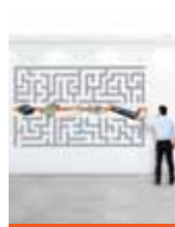
DESIGN • SIMULATIONS • TESTING •