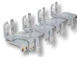
ALTERNATE FUEL SYSTEMS BUS BAR: FUEL CELLS AND HYBRID ELECTRIC VEHICLES REQUIRE RUGGED, RELIABLE POWER DISTRIBUTION