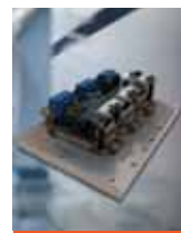
SOLUTIONS FOR SiC APPLICATIONS

Mersen is your supplier of choice for power management solutions for various industries. Contact us at ep.mersen.com for more information.